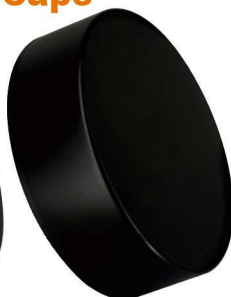
Matte Smooth Flat