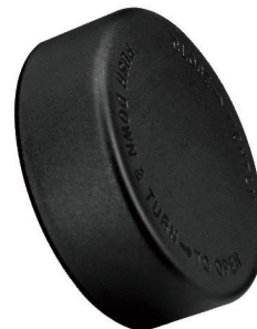
Push&Turn Matte Smooth Flat