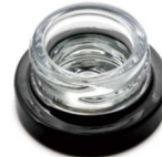
Gloss Black Silver Interior