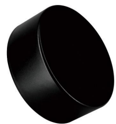
Matte Smooth Flat