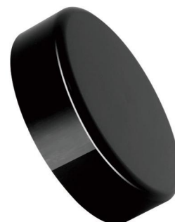
Glossy Smooth Flat