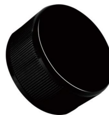
Glossy Smooth Ribbed