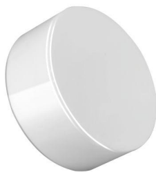
Glossy Smooth Flat