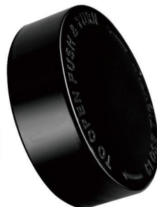
Push&Turn Glossy Smooth Flat