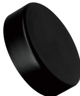
Matte Smooth Flat