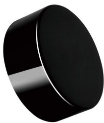
Glossy Smooth Flat