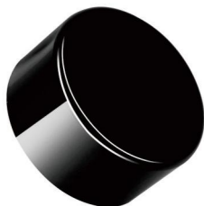
Glossy Smooth Flat