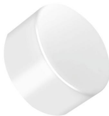
Glossy Smooth Flat