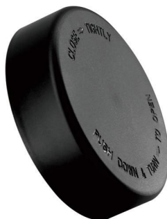
Push&Turn Matte Smooth Flat