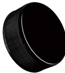
Glossy Smooth Ribbed