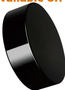
Glossy Smooth Flat