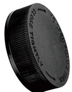
Push&Turn Matte Smooth Ribbed