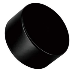
Matte Smooth Flat